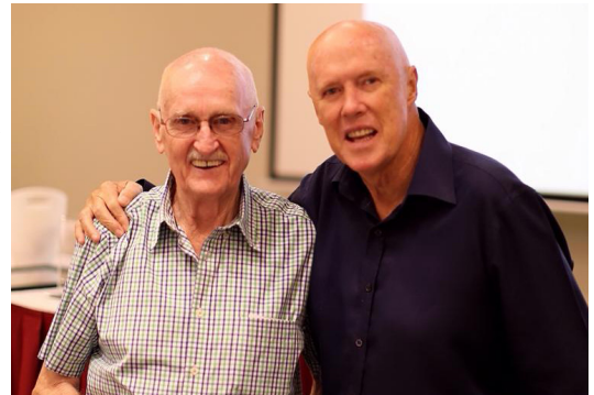
Tribs with After Dinner Speaker Kerry O'Keeffe