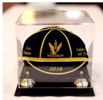
Dave with Commemoration Cap Above the cap in its jewel case