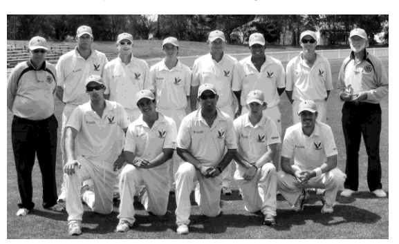
The Team on Pink Stumps Day