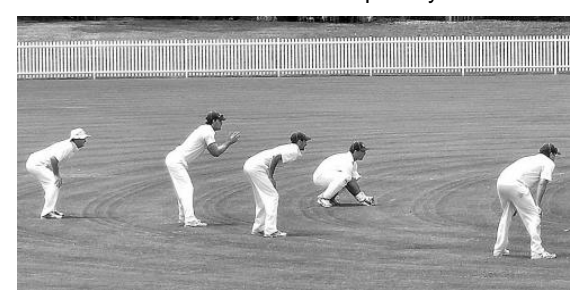
Auburn's Slips Cordon Wish the Batsman Luck