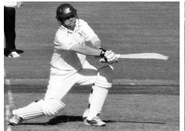
DJ Flays the Ball