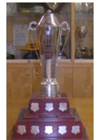
The David Tribolet Shires Club Championship Trophy