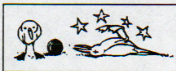
Lane Cove Pigeon visiting Mona Pk